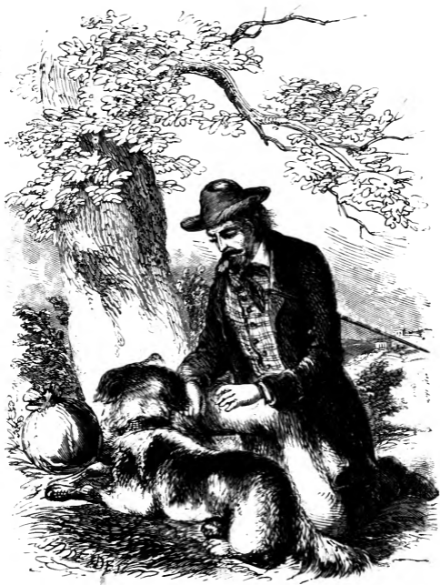
THE DOG FAITHFUL TILL DEATH. Page 92.